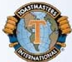
Table Topics and International Speech Contests